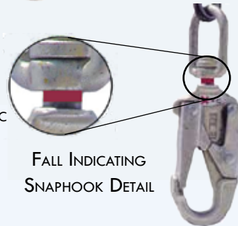
FALL INDICATING SNAPHOOK DETAIL

*ALL HY-SAFE SRL'S SHOULD ONLY BE USED IN CONJUNCTION WITH AN APPROVED ANCHORAGE OR ENGINEERED HORIZONTAL LIFELINE AND ATTACHED TO THE BACK D-RING OF A HY-SAFE HARNESS.