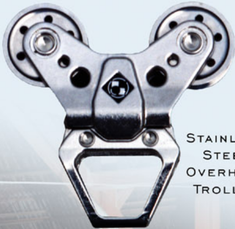
STAINLESS STEEL OVERHEAD TROLLEY

THE UNIQUE DESIGN OF THE OVERHEAD TROLLEY ALLOWS FREE MOVEMENT AND HELPS TO KEEP THE WORKER'S ANCHORAGE POINT DIRECTLY OVER THEIR HEAD, GREATLY REDUCING SWING FALL RISK. IT CAN BE USED ON OVERHEAD INCLINES OF UP TO 15°, ALLOWING ITS USE ON A GREATER VARIETY OF OVERHEAD SURFACES. THE OVERHEAD TROLLEY IS PERMANENTLY INSTALLED ONTO THE CABLE FOR GREATER EASE OF USE IN A HIGH OVERHEAD SITUATION. SHOCK ABSORBERS AND FALL INDICATORS ARE ALSO INTEGRATED INTO THE SYSTEM FOR GREATER SAFETY AND A REDUCTION OF LOADS IN THE CASE OF A FALL. HY-SAFE ALSO OFFERS A COMPLETE SELECTION OF HARNESSSES, LANYARDS, SELF RETRACTING LIFELINES, AND MANY OTHER PRODUCTS TO COMPLETE THE OVERHEAD FALL PROTECTION SYSTEM.